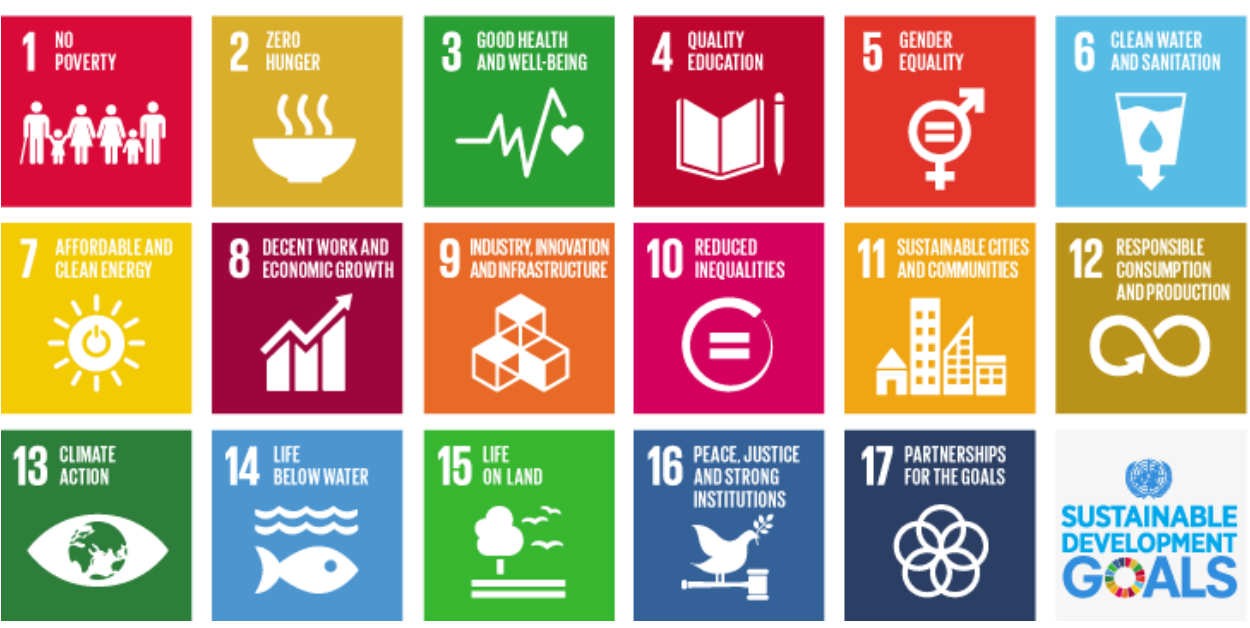
Figure 1 Illustration of the United Nations 17 Sustainable Development Goals of the Agenda 2030