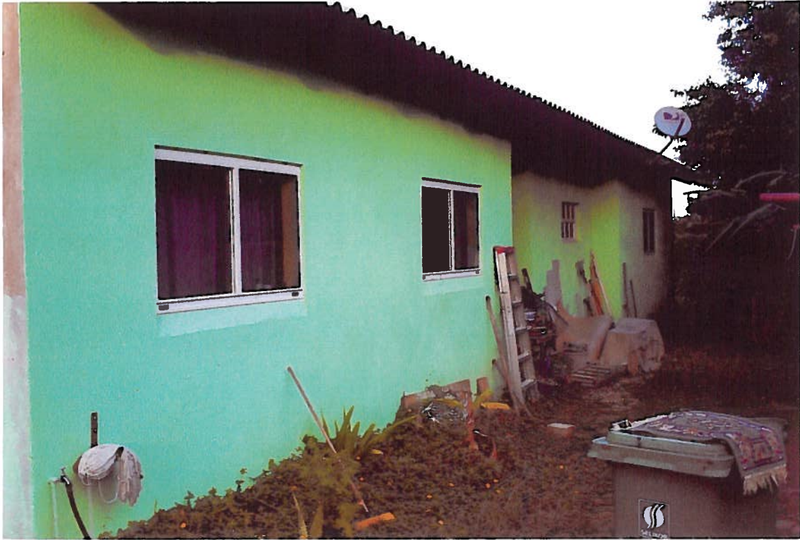
PHOTOGRAPH OF SUBJECT PROPERTY