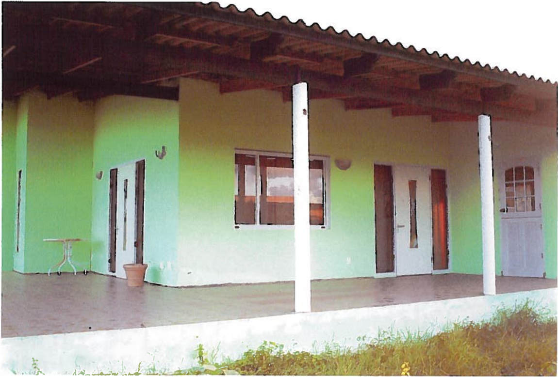
PHOTOGRAPH OF SUBJECT PROPERTY