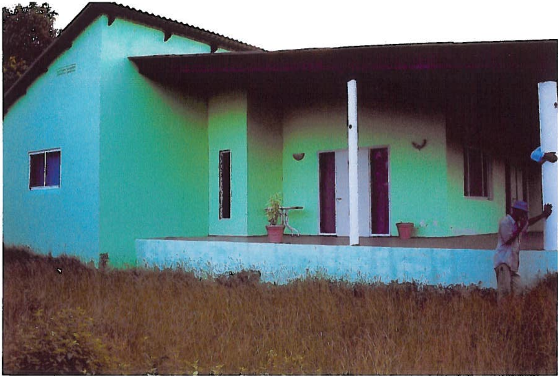
PHOTOGRAPH OF SUBJECT PROPERTY