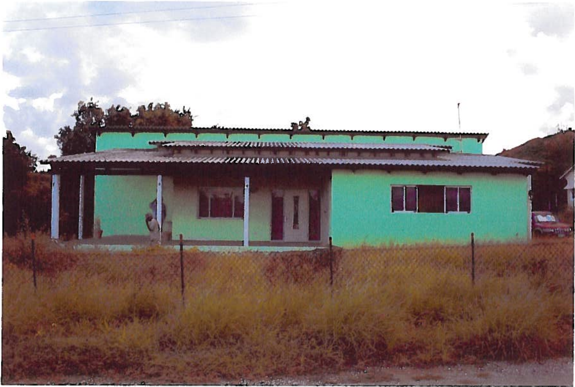
PHOTOGRAPH OF SUBJECT PROPERTY