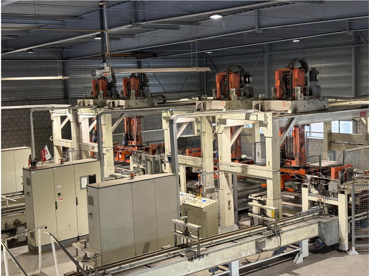
The packing line with 4 cubers