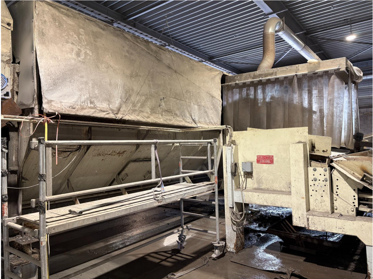
Rotating drum with the option to submerge the stones