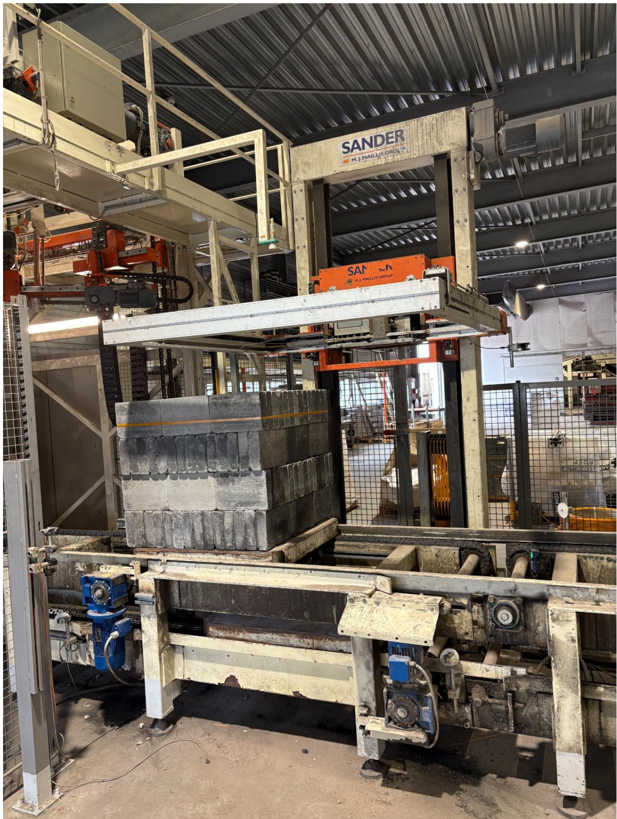
Backside of the strapping machine