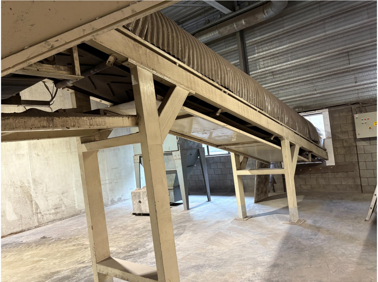
Feeding line to the drum