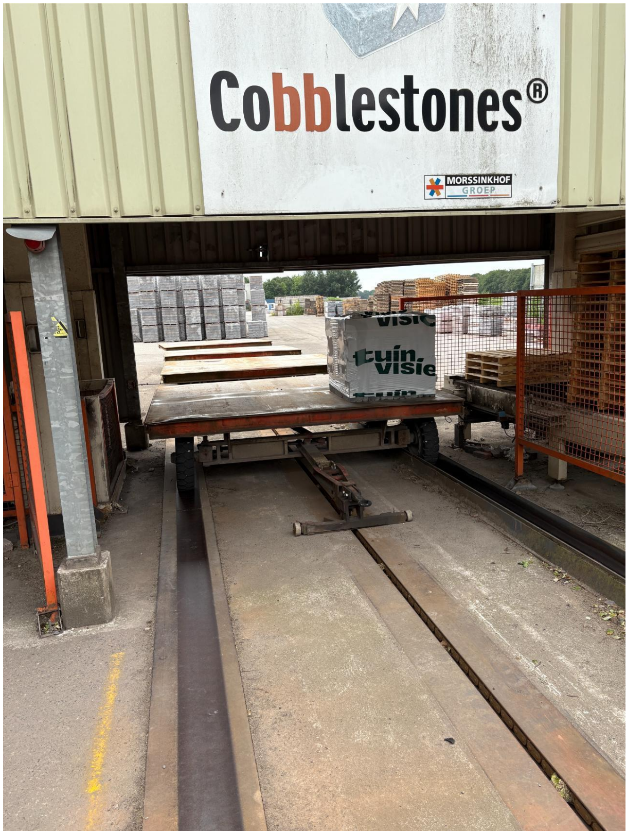
Packs being loaded onto carts