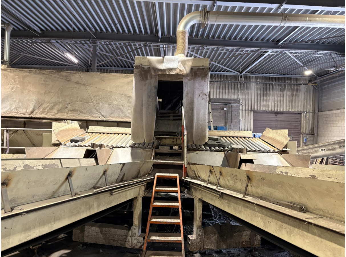
Outlet of the drum