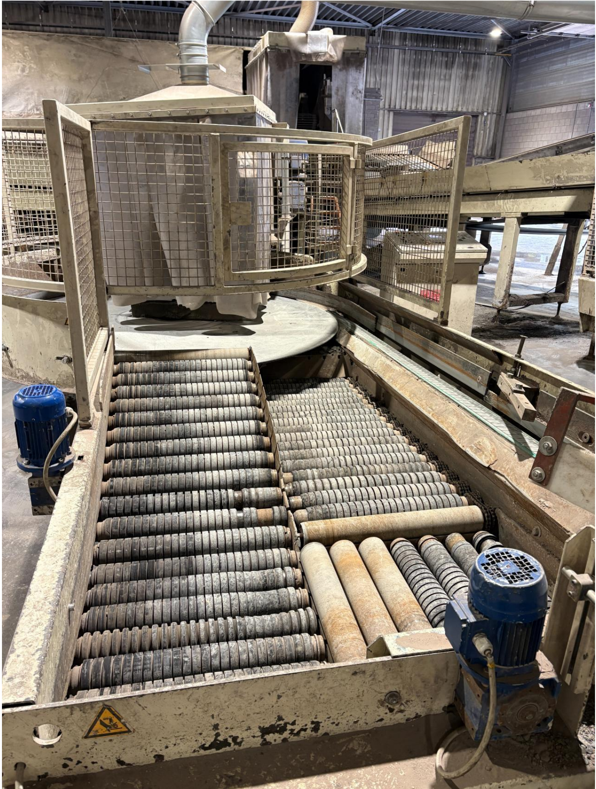
Sorting disc with return system for off-positioned stones