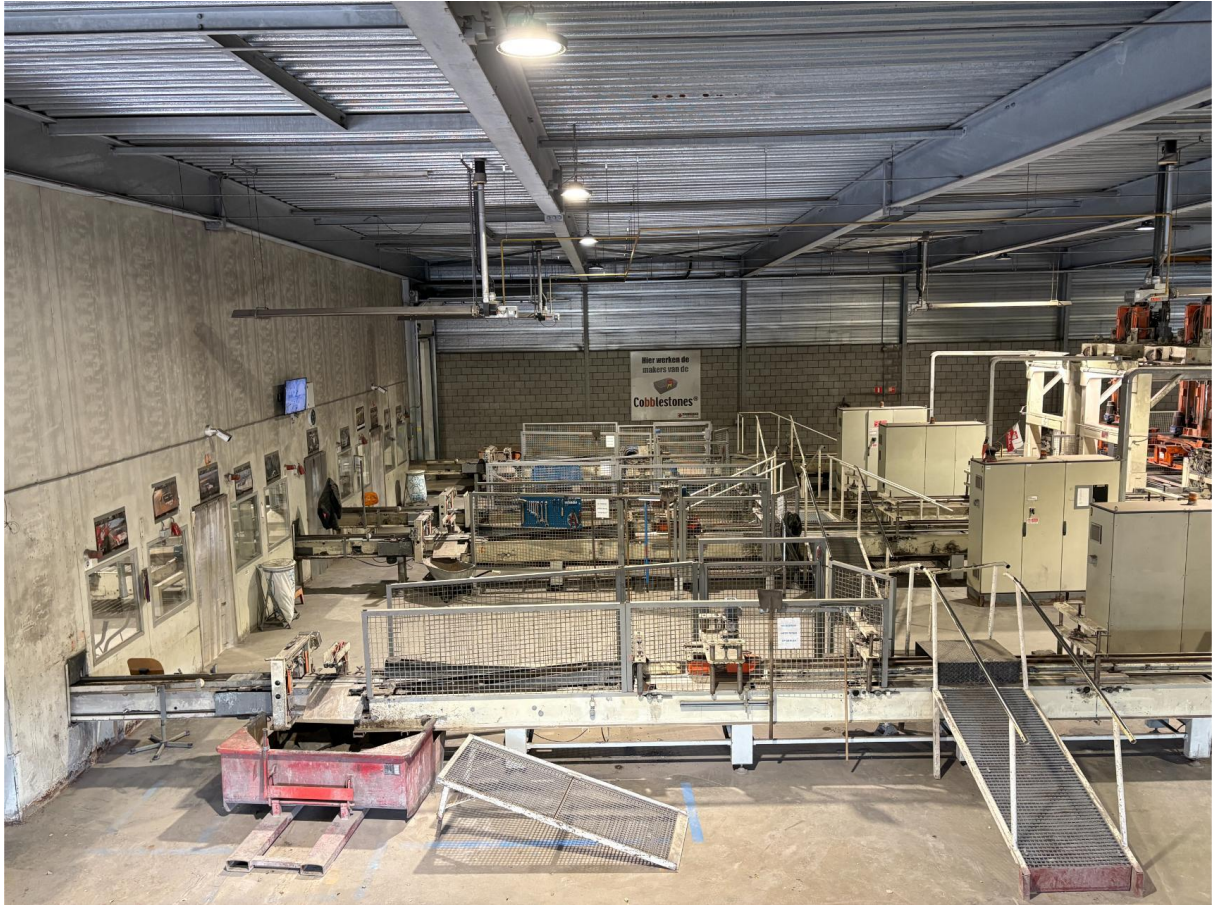
Overview of the first part of the sorting lines