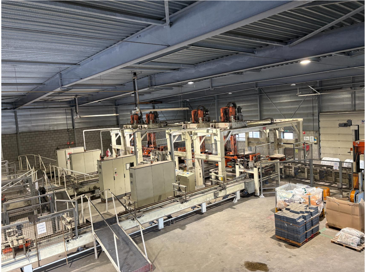
Overview of the second part of the sorting lines