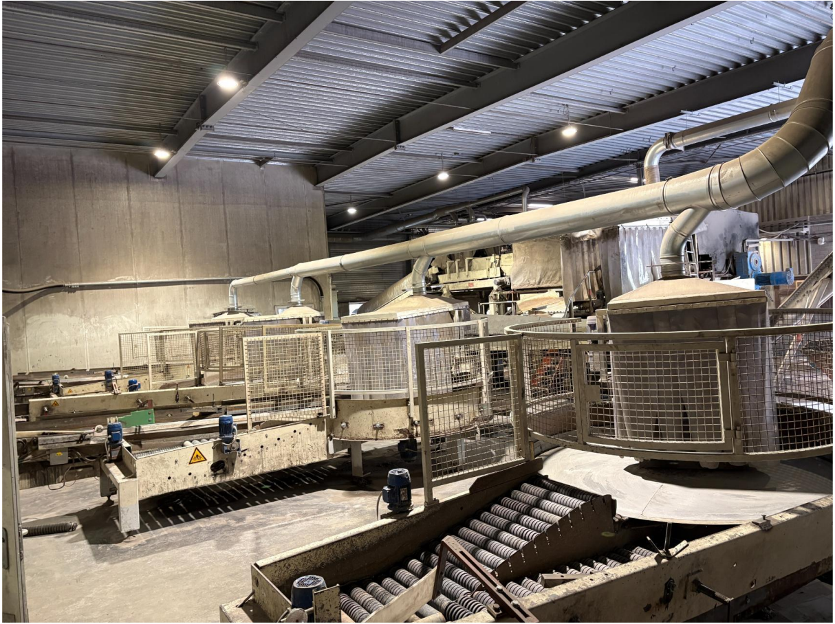
The 4 sorting discs