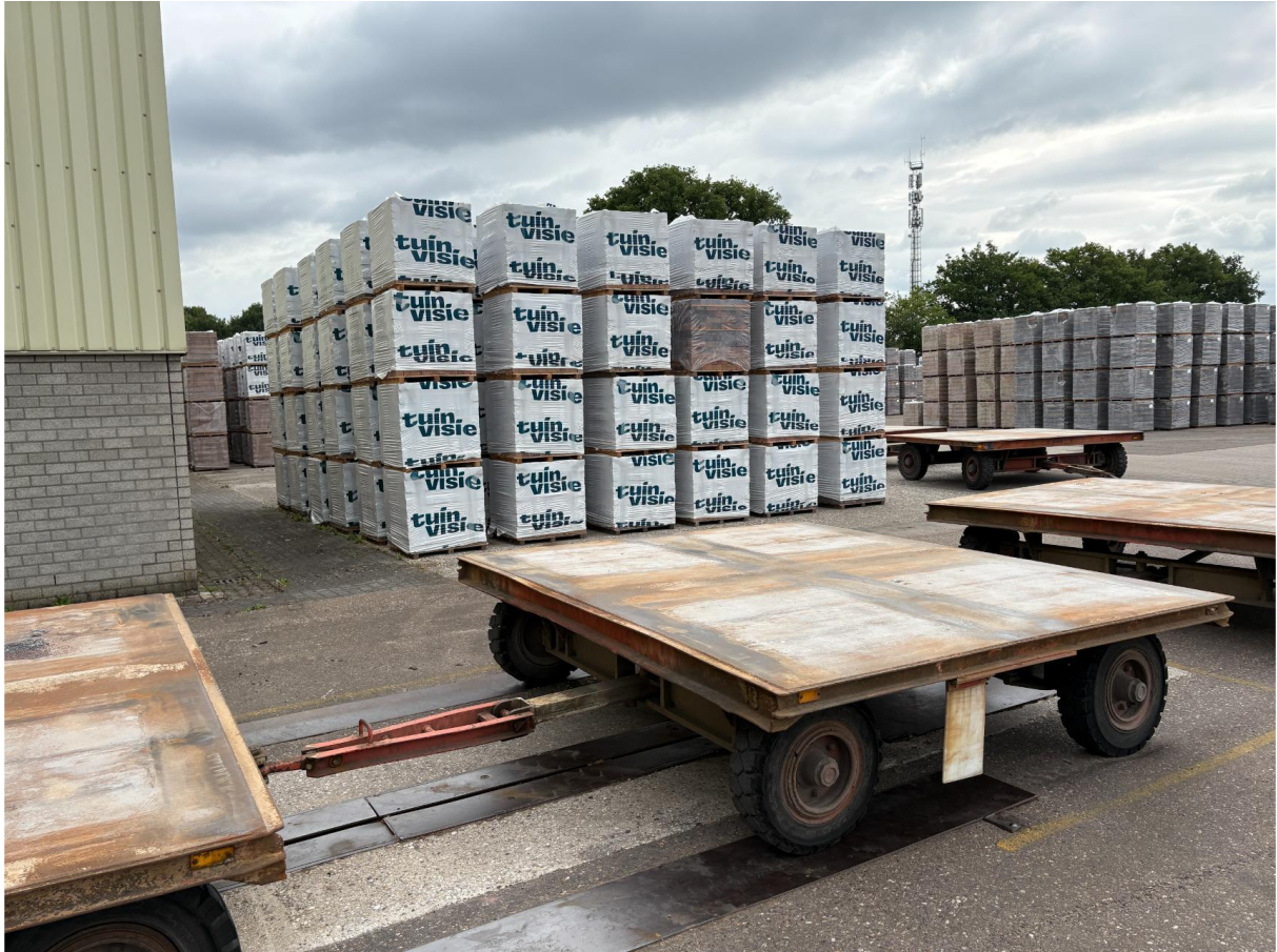
Cart system for transporting the cubes to the yard