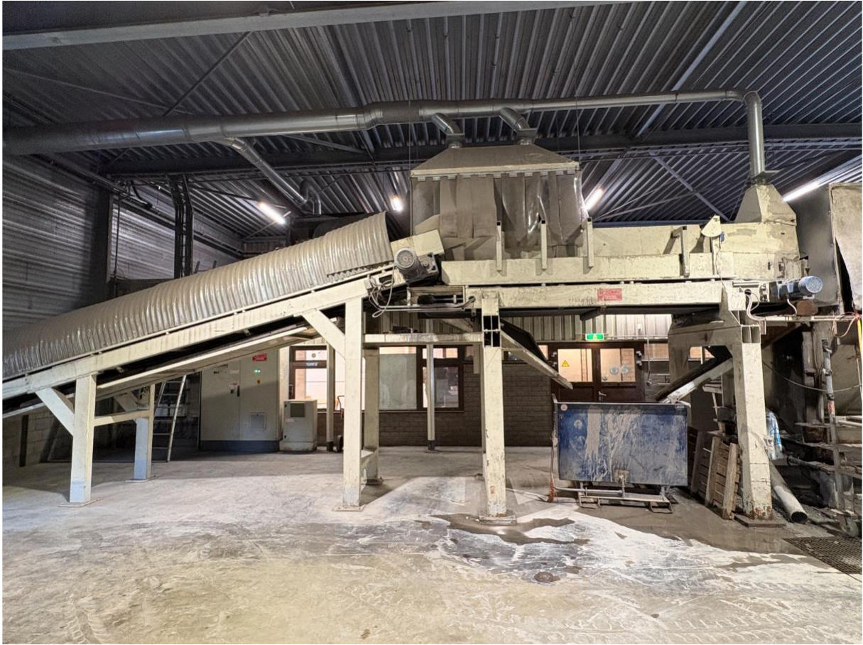
Feeding line with drum