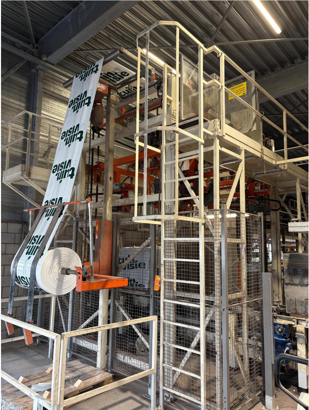
Backside of the wrapping machine