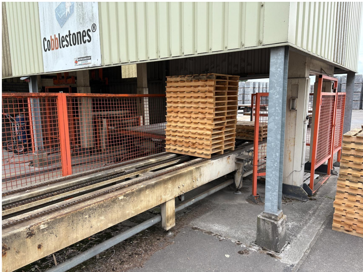
Automatic pallet destacker