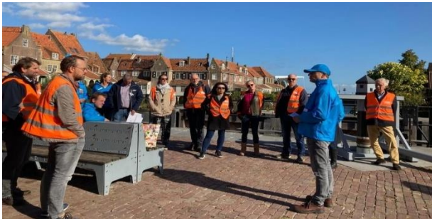
Figure 4: Several meetings, held by Hollands Noorderkwartier to transfer and uptake knowledge around seven sluices

hydraulic structures often do not get the attention they deserve. This affects the stability of the DFPP programme, but also the projects themselves. An update on the scope and number of hydraulic structures in DFPP is required in the second phase. The regional water authorities need handholds to help them get started with hydraulic structure. The lessons learned from the pilot at the regional water authority Hollands Noorderkwartier showed the effort undertaken to share knowledge. This however does not guarantee the uptake of the knowledge by all water authorities having a task.