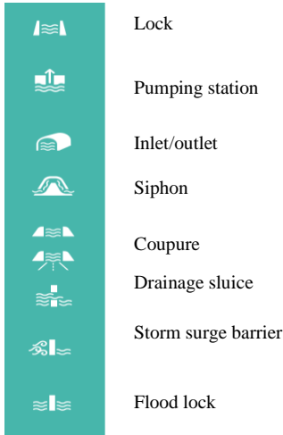
Figure 2: Artists impressions of hydraulic structures in the Dutch primary flood defence system (credit: Working jointly together on hydraulic structures’, 2022)

DFPP. Of the other remaining structures, this was unknown.